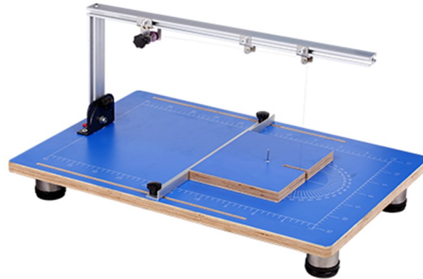
Table Top Hot Wire Foam Cutter

Maximise your creativity and productivity with the easy to use Table Top Hot Wire Foam Cutter is a true professional-grade hot cutting tool, for cutting different density foam, with fine cutting edge, no mess. Cutter requires no special training or skills and allows you to create straight edges or complex shapes, ideal for crafting dioramas and figures for fantasy tabletop role-playing games and more!