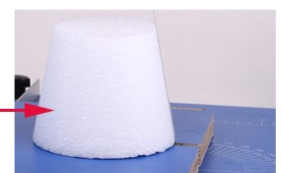
← Cut cone