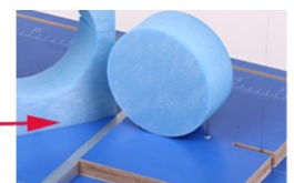
← Cut round