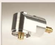
90° Angled adapter WP S2