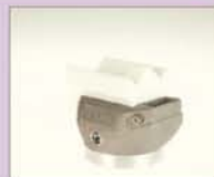
CO-12 IA Corner outside, 12 mm Article No.: 146.649