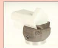
K-25 IA Fillet weld, 25 mm Article No.: 145.816