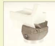
V-30 IA V-seam, 30 mm Article No.: 145.905