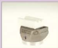
CO-10 IA Corner outside, 10 mm Article No.: 146.645