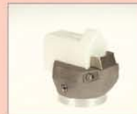
K-15 IA Fillet weld, 15 mm Article No.: 145.812