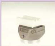
CO-8 IA Corner outside, 8 mm Article No.: 146.643