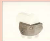
K-8/10 IA Fillet weld, 8/10 mm Article No.: 145.944