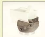
V-20 IA V-seam, 20 mm Article No.: 145.909