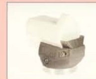
K-20 IA Fillet weld, 20 mm Article No.: 145.940