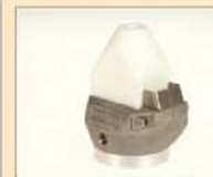
CL-14 IA Corner seam, 14 mm Article No.: 145.811