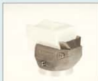
UBL-30 IA Overlap seam, 30 mm Article No.: 145.947