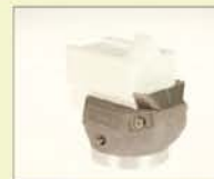
V-15 IA V-seam, 15 mm Article No.: 145.903