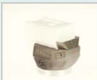
UBL-25 IA Overlap seam, 25 mm Article No.: 145.896