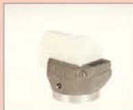
K-5/6 IA Fillet weld, 5/6 mm Article No.: 145.943

Leister Integrated Air System (IA): The air guidance is integrated into the welding shoe. This enables the turning of the shoe 360° into every desired welding and seam position.