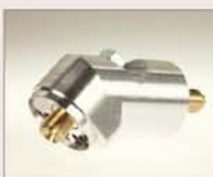
45° Angled adapter WP S2