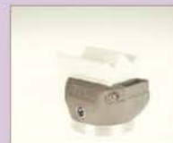
CO-15 IA Corner outside, 15 mm Article No.: 146.651