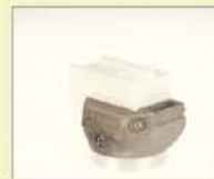
V-8/10 IA V-seam, 8/10 mm Article No.: 145.915