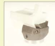
V-25 IA V-seam, 25 mm Article No.: 145.916