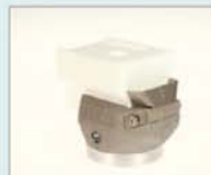
UBL-35 IA Overlap seam, 35 mm Article No.: 145.897