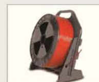
Welding rod de-reeler for 1 reel Article No.: 144.095