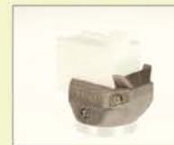
V-12 IA V-seam, 12 mm Article No.: 145.907