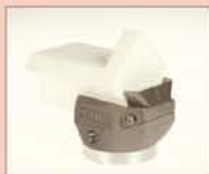
K-30 IA Fillet weld, 30 mm Article No.: 145.817