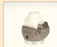
CS-20 IA Corner seam, 20 mm Article No.: 145.488