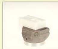
V-5/6 IA V-seam, 5/6 mm Article No.: 145.912