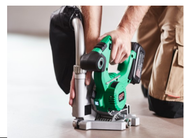
Groover 500 LP 230V 167.451