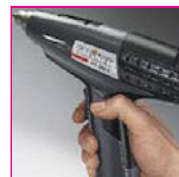
Optimised weight balance ensures fatigue-free working