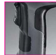
The ergonomically shaped soft grip handle ensures comfortable handling