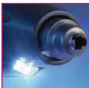
The LED light always provides bright illumination in the work area and also serves as a telltale lamp