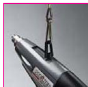
With its hanging rig, the BHG 350 Li-Ion is always in easy reach in extreme work situations