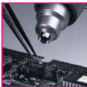
Ideal for de-soldering electronic components