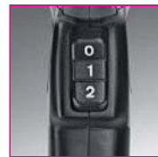
Conveniently positioned control switch for setting OFF/COLD/HOT