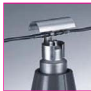
With optional reflector nozzle, ideal for shrinking cable sleeves