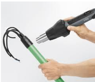
Welding in Apparatus Construction