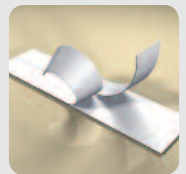
Easy-to-peel split backing

inserts or other applications where adhesive is not required