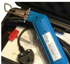
HC300 Hand Held Hot Knife Cutter with Case