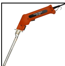
KD-5HG Hot Knife Cutter with 200mm Blade in 230/110V