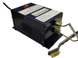
HC400 Bench Mounted Hot Knife Cutter